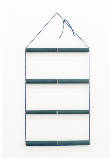
Oliver Perkins, Untitled , 2019. Ink, rabbit skin glue, canvas, dowel, rope and staples, 101.5 x 49 x 3.5 cm.

Internalising this emptiness allows these paintings to absorb foreign qualities both referential and material. Such porosity can also be seen in Perkins' material register where alongside ink, acrylic, canvas and rabbit-skin glue, he employs more commonplace materials, such as the wooden doweling and rope, enamel house paint and staples. As a counterpoint to the use of rigid geometry, this material exploration reminds us of painting's relationship to the everyday and distinguishes Perkins' practice from a kind of sober modernism.