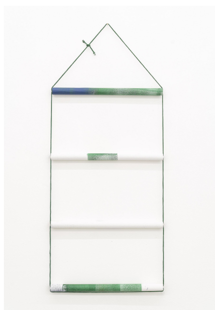
Oliver Perkins, Untitled , 2019. Acrylic, pre-primed canvas, rope, dowel and staples, 98 x 42 x 2.5 cm

Lundberg and Perkins turn to painting as an instrument by which to examine the world. In doing so, the artists open up a broader examination of the boundaries between object and non-object oriented practices. Launching from Barbaras' conception of 'nothingness as a mirage', both artists look to compose with