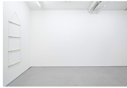
Patrick Lundberg, No Title (detail), 2019. Acrylic on wood 16 parts (dimensions variable). Each part 10 - 20 mm diameter.