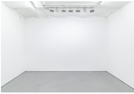
Patrick Lundberg, No Title , 2017. Acrylic on resin, 21 parts (dimensions variable). Each part 19 mm diameter.