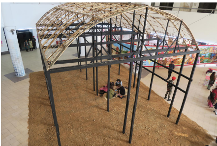
Mataaho Collective practising under the work of Taloi Havini, Dhaka Art Summit, February 2020.