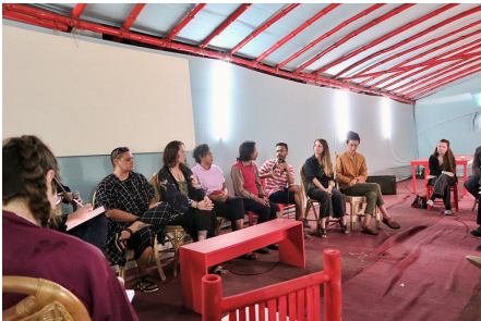
Mataaho Collective speaking at Dhaka Art Summit, February 2020.

Because when we do waiata and practice customary things, that's not a performance either, it has a real practicality and plays a role. Either to support those who have spoken, or it's like a gift. When we travel, we've been able to stand and acknowledge people who've hosted us without giving physical gifts, but by singing to them. It's never a performance for us, in the Western ideology sense, and we're uncomfortable with the idea of being performative of our culture.