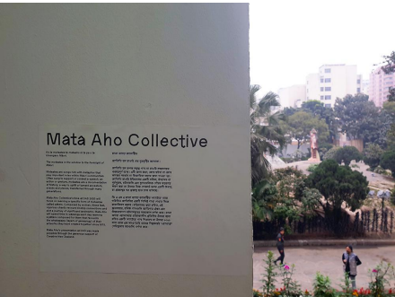
Dhaka Art Summit, February 2020.