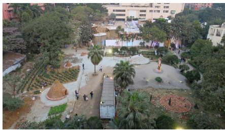
Dhaka Art Summit 2020: Seismic Movements, February 2020. Photo: Contemporary HUM.