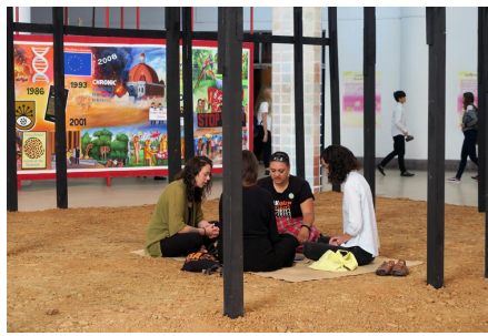
Mataaho Collective at Dhaka Art Summit 2020: Seismic Movements, February 2020.