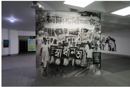
Photojournalist Rashid Talukder's photo of the arms drill by women members of the Chatro student union in 1971 greets visitors arriving at DAS 2020: Seismic Movements , February 2020.