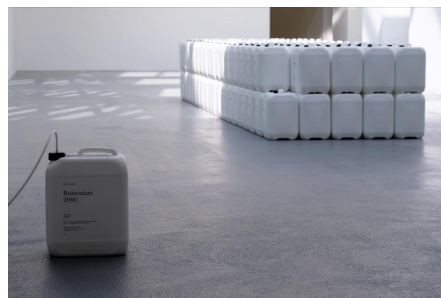
Dane Mitchell, Imponderable, Antimatter , 2018. Courtesy Hopkinson Mossman, Auckland. Photo: Dane Mitchell.

In the South Hall of the IAC, a long space that leads to the auditorium which usually marks the end of the show, there is a glass wall behind which stands a closed-off garden. A series of plastic containers installed in the middle of the room draws a barrier in front of the large windows, their ghostly white forms reflected in the glass. Inaccessible to the public, it is the first time that an artist has used the outdoor patio to install a work. Dane Mitchell's Imponderable, Antimatter , 2018, gives a clue and offers a