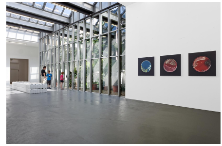
Dane Mitchell, OTTUM #3 exhibition view, 2018.