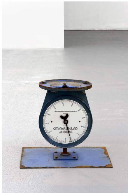
Dane Mitchell, Weight of the World (North) , 2015.