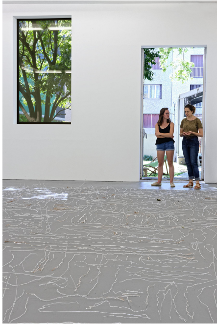
Dane Mitchell, OTTUM #3 exhibition view, 2018.