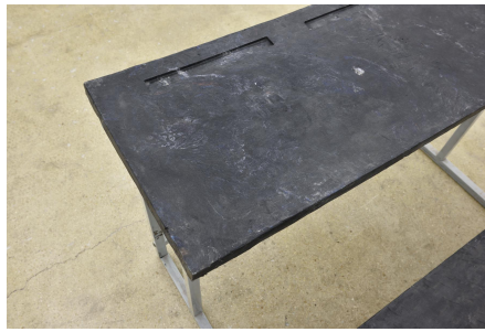
Jean-Marie Perdrix, Sans titre (détail) , 2016.