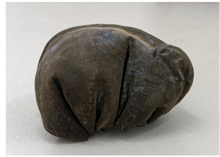
Jean-Marie Perdrix, Sans titre , 2016. Courtesy of the artist. Photo: Blaise Adilon.