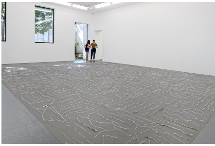
Dane Mitchell, OTTUM #3 exhibition view, 2018.