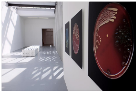
Dane Mitchell, OTIUM #3 exhibition view, 2018.

photograph taken of his work by Man Ray titled Elevage de poussière , 1920. This close-up shot of Duchamp's Grand Verre , 1915, looks like an aerial photograph of an archeological site. Growing matter that the eye can't see, magnifying dirt and showing that there is life in apparently dead matter (dust/bacterias), are processes that make us think about our ways of perceiving the world. Doubt becomes a criteria to evaluate our environment, through a scientific approach: what we see may be different than what we think.