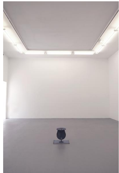
Dane Mitchell, Weight of the World (North) , 2015.

This is not a metaphor for anything else but a place divided in two parts - inside and outside - in the same way that the rooms of Aero mancy seem to be duplicates. The work is not metaphorical, nothing is 'like' or 'as' something else, but instead is a real attempt to fill an open space, a portion of nature, with its possible double.