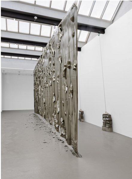
Linda Sanchez, OTTUM #3 exhibition view, 2018.