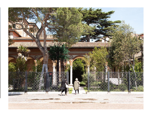
Dane Mitchell, Post hoc (installation view), 2019. Mixed media installation, New Zealand Pavilion 58th International Art Exhibition La Biennale di Venezia.