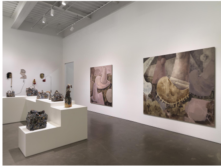
2021 Triennial: Soft Water Hard Stone , 2021. Exhibition view: New Museum, New York.

this, it opens new avenues in thinking about the act of painting as just a tiny way that art can exist in the world”, Norton said excitedly, as I inspected the canvas’s subtle seams.