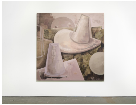
Christina Pataialii, Night Drills , 2021. Acrylic and house paint on drop cloth canvas. 77 1/4x 77 1/4in (196.2 x 196.2 cm). Courtesy the artist and McLeavey Gallery, Wellington. 2021 Triennial: Soft Water Hard Stone , 2021. Exhibition view: New Museum, New York.