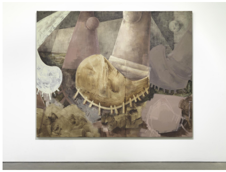
Christina Pataialii, Footsteps in the Dark , 2021. Acrylic and house paint on drop cloth canvas. 101 1/2x 82 1/4in (257.8 x 208.9 cm). Courtesy the artist and McLeavey Gallery, Wellington. 2021 Triennial: Soft Water Hard Stone , 2021. Exhibition view: New Museum, New York. Photo: Dario Lasagni. Courtesy New Museum.