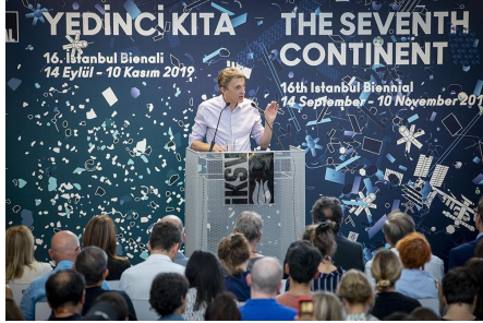
Biennial curator Nicolas Bourriaud speaking at the 16th Istanbul Biennial, 2019.

skeleton of a water buffalo rests on a concrete slab, spotlight in the centre of an otherwise dark room. Screens on the surrounding walls show footage of recent construction of a new Istanbul airport and motorways, urban progress that is causing the destruction native water buffalo habitat.