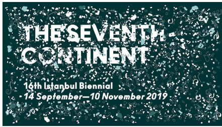
16th Istanbul Biennial poster.