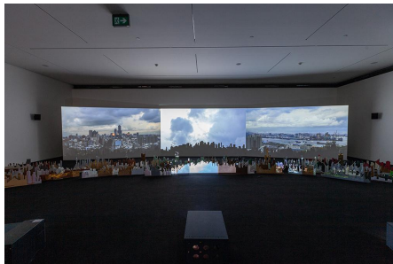
En Man Chang, Ungrounding Land - Ljavek Trilogi , 2018. Three channel video installation, 13'9". Dimensions variable. Courtesy the artist.