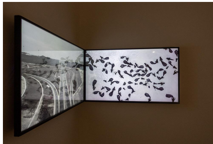
Ozan Atalan, Monochrome , 2019. Installation (concrete, soil, video, water buffalo skeleton). 3 × 3 × 1 m. Video: 10'. Courtesy the artist. Commissioned by the 16th Istanbul Biennial. Co-produced by the 16th Istanbul Biennial and MO.CO. Montpellier Contemporain with the support of SAHA-Supporting Contemporary Art from Turkey.

These works do not have very much directly in common, except perhaps for their tangible subject matter. The works invoke real losses, displacements and existential threats. That these works deal in reality may not seem like a particularly unusual or pointed connection, until you consider its comparative absence elsewhere in the Biennial. One room in the Pera Museum resembles an ethnographic museum display, with Norman Daly's decades-long project depicting archaeological remnants of the fictional Civilisation of Llueros, created by Daly out of commonplace materials such as fork handles, lemon squeezers and polystyrene