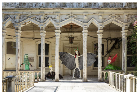
Monster Chetwynd, The Gorgon's Playground , 2019. Sculptural installation. 282 × 600 × 345 cm. Courtesy the artist and Sadie Coles HQ, London. Commissioned by the 16th Istanbul Biennial. Produced and presented with the support of Koç Holding.

The forces at play that bring artists to the attention of a curator like Bourriaud and, relationally, cause them to appear on the competitive international biennial circle do more to explain the absence of artists from the South Pacific than speculations on conceptual blindspots or gaps in curatorial reasoning. Much has been written on the “resolutely Northern histories” of international biennials, showcases that reinforce, “even in their self-reflexive critique, a lineage of influence within and of the North – despite their claims to globality.” [22] And as it happens, artists from Aotearoa and the broader South Pacific were well-represented elsewhere on the international Biennial circuit in 2019: beyond Dane Mitchell in Venice, there was, for example, Simon Denny in Vienna, Lisa Reihana in Toronto, and a huge showing of South Pacific artists and art collectives in Honolulu.