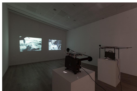
Paul Sietsema, Figure 3 , 2008. 16mm film, black-and-white and colour, no sound. Approx. 16'. Courtesy the artist and Matthew Marks Gallery. Presented with the support of Matthew Marks Gallery.

radicality of this move”, consequently, “remains stymied by the absence of indigenous voices in and about the mutually affecting spread of modernity.” [19] Bourriaud considers the exhibition to function as a “reverse mirror-image of our societies,” where “the seventh continent is the country we don’t want to inhabit, made up of everything we reject.” [20] But as Anselm Franke has observed, the self-reflexive critique of Western dichotomies between humans and nature may function as a “mirror”, but one that excludes more than it reflects. [21]