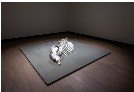
Ozan Atalan, Monochrome , 2019. Installation (concrete, soil, video, water buffalo skeleton). 3 × 3 × 1 m. Video: 10'. Courtesy the artist. Commissioned by the 16th Istanbul Biennial. Co-produced by the 16th Istanbul Biennial and MO.CO. Montpellier Contemporain with the support of SAHA—Supporting Contemporary Art from Turkey.