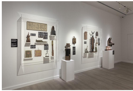
Norman Daly, Civilization of Llhuros , 1972. Mixed media (artifacts, sounds, texts). Dimensions variable.