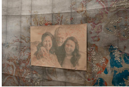
Pia Arke, Legend I-II-III-IV-V , 1999. Five mixed media collage. 213.5 × 181.5 × 4 cm. Presented with the support of Danish ArFoundation.