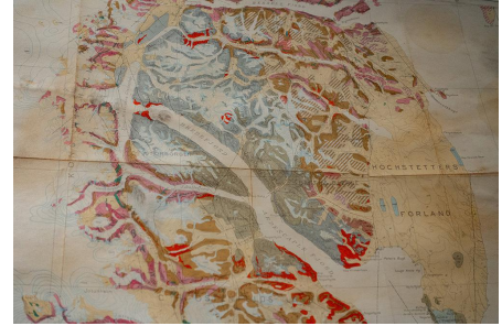
Pia Arke, Legend I-II-III-IV-V , 1999. Five mixed media collage. 213.5 × 181.5 × 4 cm. Presented with the support of Danish ArFoundation.