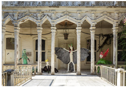
Monster Chetwynd, The Gorgon's Playground , 2019. Sculptural installation. 282 × 600 × 345 cm. Courtesy the artist and Sadie Coles HQ, London. Commissioned by the 16th Istanbul Biennial. Produced and presented with the support of Koç Holding.