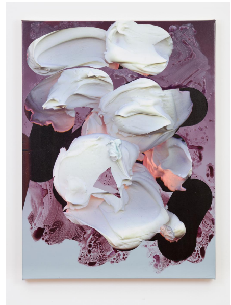
André Hemer, New Smart Object Plus #16 , 2015. Acrylic, oil and pigment on canvas, 88 x 66 cm.