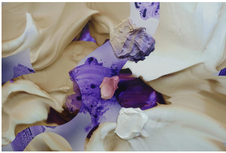
André Hemer, A Hot Mess #3 (detail), 2015.