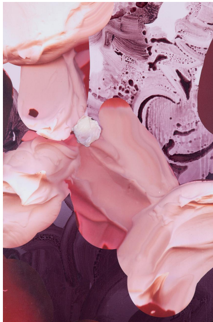
André Hemer, New Representation #3 (detail), 2015.