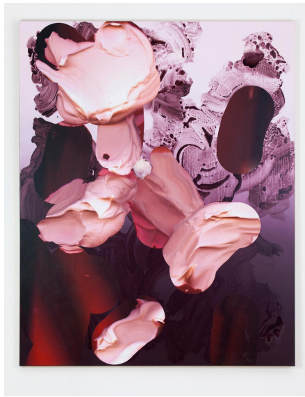
André Hemer, New Representation #3 , 2015, acrylic, oil and pigment on canvas, 151.5 x 121cm.