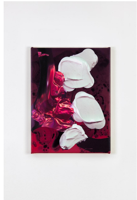
André Hemer, A Hot Mess #3 , 2015. Acrylic and pigment on canvas, 40 x 30cm.

In A Hot Mess #3 the cut of digitally-printed gestural and petal-like forms radiate—under and over layers of background print and hand-painted gestures, from a centre of corresponding gestural and hand-built, three dimensional forms. Somewhat quixotically, I describe it as punctuated by a floral ‘boom,’ because that was the word I actually said quietly to myself in the gallery as I also made a corresponding gesture with my hand—opening it suddenly from closed.