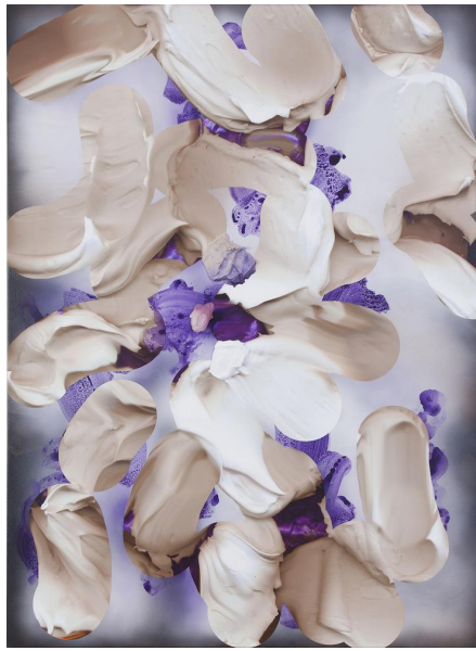
André Hemer, A Hot Mess #3 , 2015. Acrylic, oil and pigment on canvas, 137.5 x 102.5 cm.