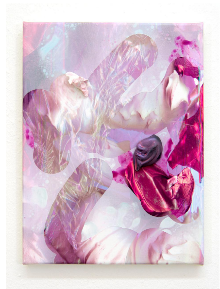
André Hemer, Towards Deep Surfacing #4 , 2016. Acrylic and pigment on canvas, 36 x 27 cm.